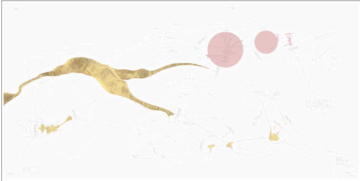
Mille Plateaux (I) Rhizom, Pink Panther; Interne Zentren; Externe Zentren; Ausrichtung Interne Zentren; Ausrichtung Externe Zentren; Rotationsrichtung; Rotationsgeschwindigkeit 1-11 Umdrehungen/Tag [Mille Plateaux (I) Rhizome, Pink Panther; Internal centres; External centres; Orientation of the internal centres; Orientation of the external centres; Rotational Direction; Rotational Speed 1–11 rotations/day], Jorinde Voigt, Berlin 2012, 92 x 184 cm, coloured vellum and Ingres paper, ink, pencil, gold leaf on paper, unique, signed (WV 2012-284 )