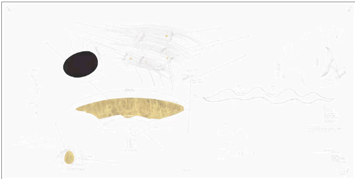
Mille Plateaux (II) Organloser Körper, Interne Zentren; Externe Zentren; Ausrichtung Interne Zentren; Ausrichtung Externe Zentren; Rotationsrichtung 1-12 Umdrehungen/Tag [Mille Plateaux (II) Organ-less body, Internal centres; External centres; Orientation of the Internal Centres; Orientation of the External Centres; Rotational Direction 1–12 rotations/day]; Jorinde Voigt, Berlin 2012, 92 x 184 cm, coloured vellum and Ingres paper, ink, pencil, gold leaf on paper, unique, signed (WV 2012-285)